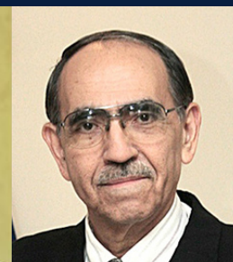
Ruben Zamora EL SALVADOR