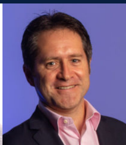
Enrique Roig U.S. DEPARTMENT OF STATE