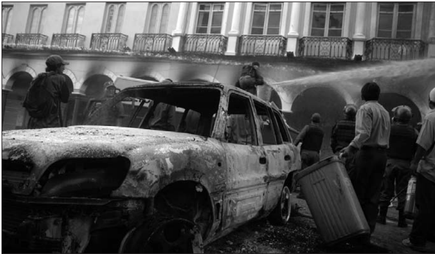
A burned vehicle sits in front of the embattled prefecture building.