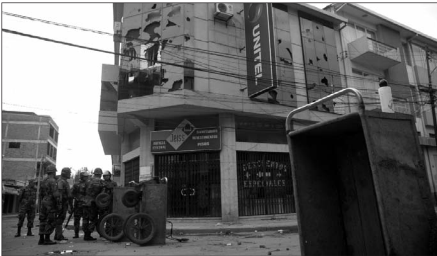
Accused by the MAS of supporting the opposition, the headquarters of Unitel Network is targeted by protesters.