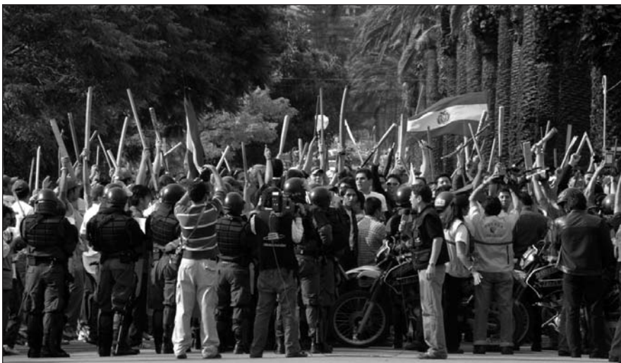
Citizens demanding the return to law and order are prevented by police from marching to the Plaza de las Banderas, under siege by protesters.