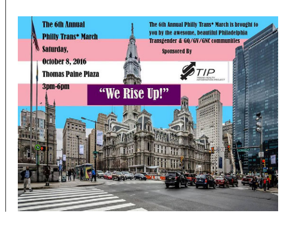
Figure 1: Online Engagement Material Promoting the Intervention and Community Social Justice Initiatives

All of TIP's clients are ITE from the northeast corridor, including Philadelphia; Camden, New Jersey; and Trenton, New Jersey, who are currently living with HIV or are at risk for HIV infection. Interagency and interdisciplinary collaboration for the