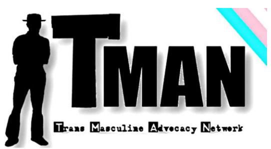
Figure 4: Trans-Affirming Intervention Content for Men of Trans Experience Promoted through Transhealth Information Project Online Social Networks

promotion of health and wellness for ITE have been essential and instrumental in the growth of TIP. TIP's success in establishing community collaborations builds from trust and community activism. In particular, our Philadelphia prison system collaboration, building on educational collaborations and mutual interest in serving the needs of ITE, resulted