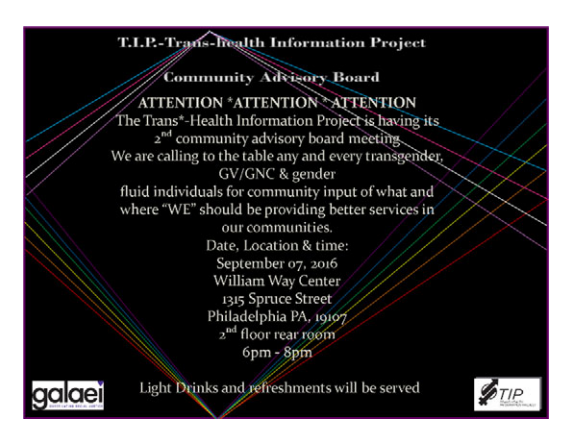
Figure 3: Trans-Affirming Intervention Content Promoted through Transhealth Information Project Online Social Networks